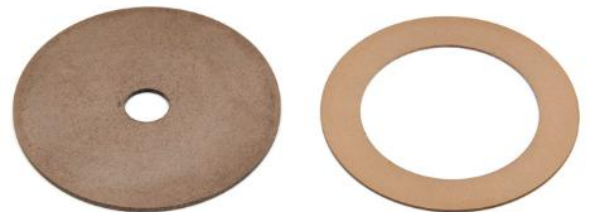
Cutting wheel without core